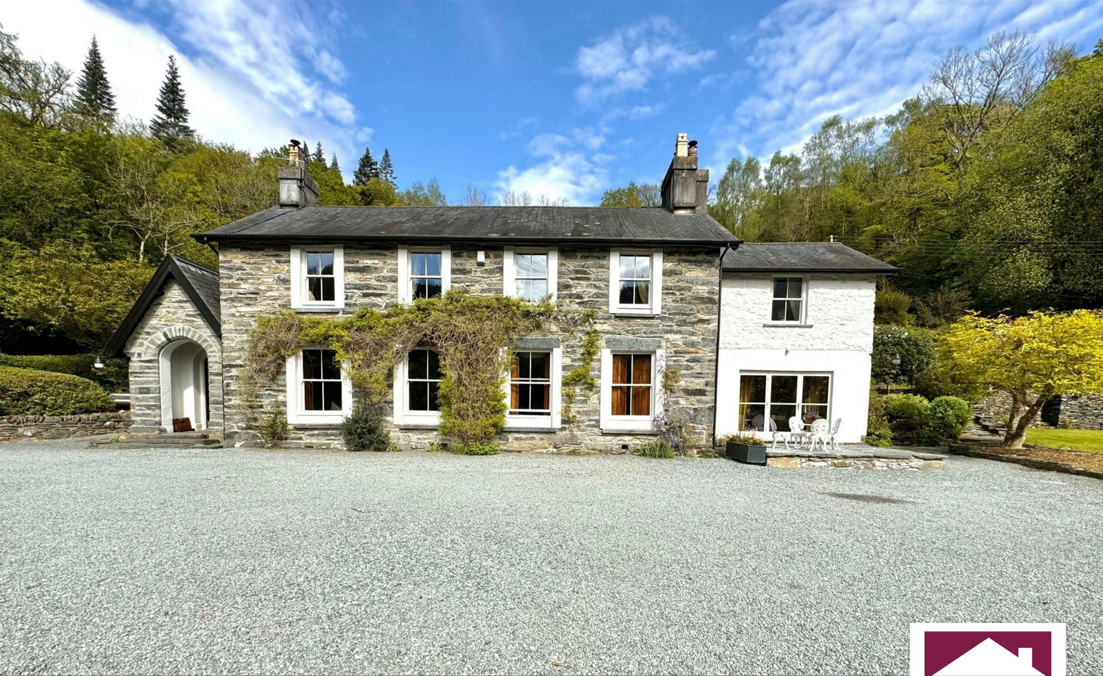
Coedfa and Coedfa Bach Betws-Y-Coed LL24 0SG